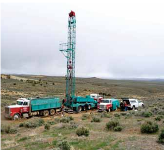
Drilling on the Skyline property

Over the past few years there has been renewed activity in the oil shale deposits of Utah and Colorado. Norwest has been assisting Oil Shale Exploration Company (OSEC) with its endeavors to develop its oil shale resources located near the White River in eastern Utah. In late 2008, OSEC entered into a business arrangement with Petrobras