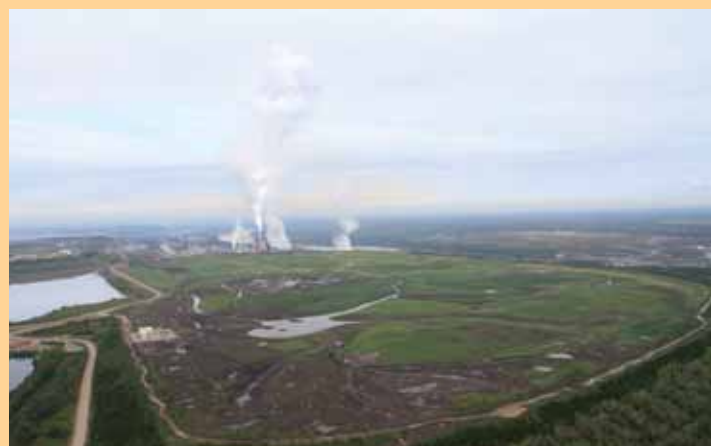
Wapisiw Lookout, September 2010

Pond 1 was constructed in 1967. Pond 1 was in active use between 1967 and 1999, providing containment for liquid fine tailings. Several years ago, Suncor made a commitment to achieve the closure of Pond 1 to a trafficable surface by the end of 2010. Between January and April 2010, Norwest participated in the construction of the