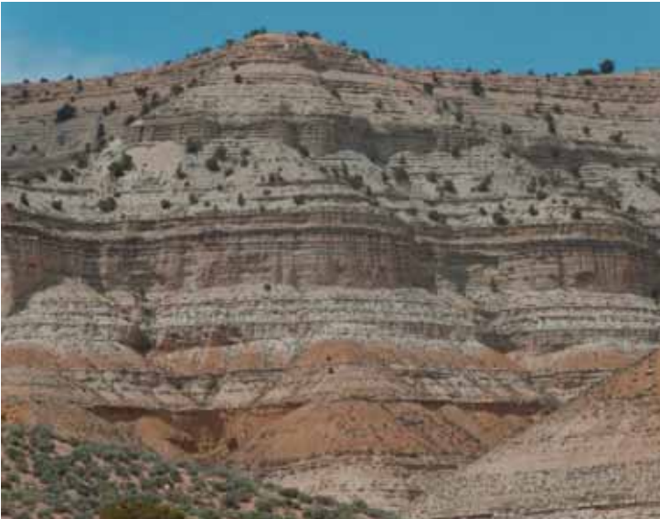
Oil shale in the Green River Formation. The particularly dark band across the center of the photograph is known as the Mahogany Bed. Retorting can capture as much as 70 gal/ton of oil from the Mahogany Bed.

Over the past few years there has been renewed activity in the oil shale deposits of Utah and Colorado. Norwest has been assisting Oil Shale Exploration Company (OSEC) with its endeavors to develop its oil shale resources located near the White River in eastern Utah. In late 2008, OSEC entered into a business arrangement with Petrobras